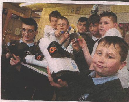
STARS IN THEIR EYES ... youngsters from Epina y during their space event.

Children become rocket stars for science project