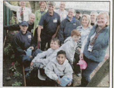
GREAT DAY... Epina School gardening club members and volunteers.

"I thoroughly enjoyed my morning helping out, and some beautiful autumn weather made it even better."